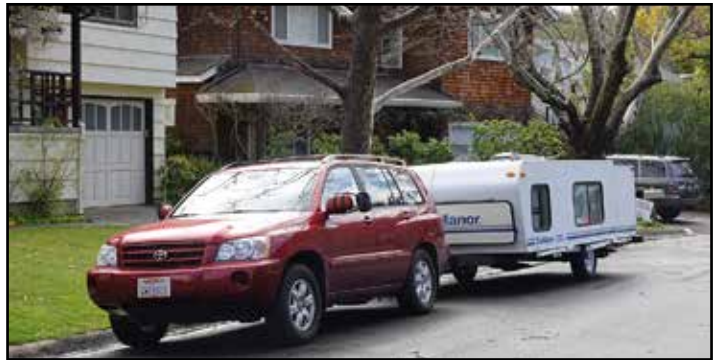
Our 2002 Highlander and 2000 TrailManor