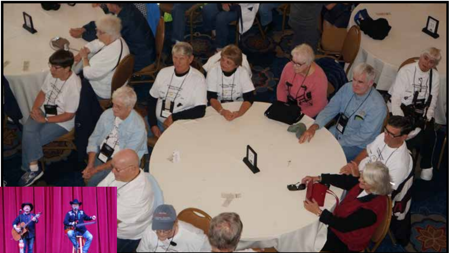
Dining on the General Jackson. A malfunction of the paddlewheel prevented paddling down the river, but we still enjoyed a buffet lunch and entertainment.