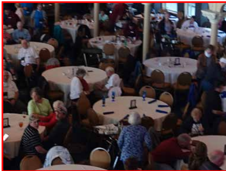
Dining on the General Jackson. A malfunction of the paddlewheel prevented paddling down the river, but we still enjoyed a buffet lunch and entertainment.