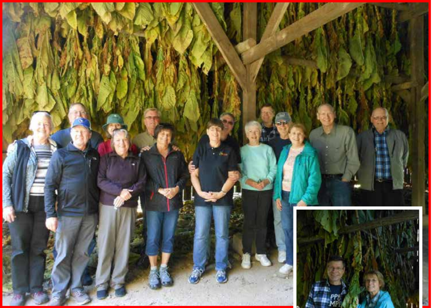
Historic tobacco farm, Natchez Trace National Park